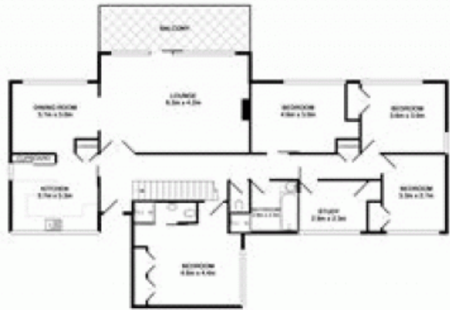
SECOND FLOOR AREA 142.10 SQM 100% BOUNDARY ACCORDANCE WITH 2014 B.C. B.C.P.L.