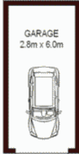
GARAGE 2.8m x 6.0m